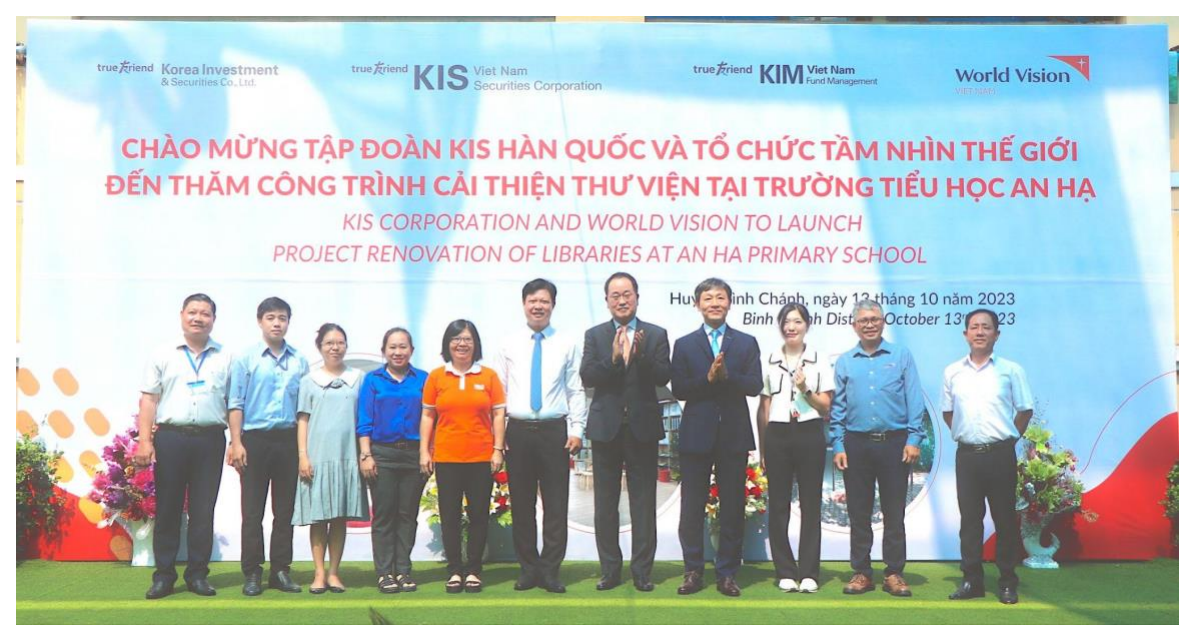
The launching ceremony was attended by representatives from KIS Viet Nam, KIM Viet Nam, World Vision Vietnam, the principal of An Ha Primary School and Le Minh Xuan 3 Primary School, the Department of Education and Training of Binh Chanh district and other local partners.

The groundbreaking ceremony was attended by representatives from the Department of Education and Training of Binh Chanh, Le Minh Xuan People's Committee, Pham Van Hai People's Committee, KIS Viet Nam, KIM Viet Nam, World Vision Viet Nam, administors, teachers and students of the two schools.