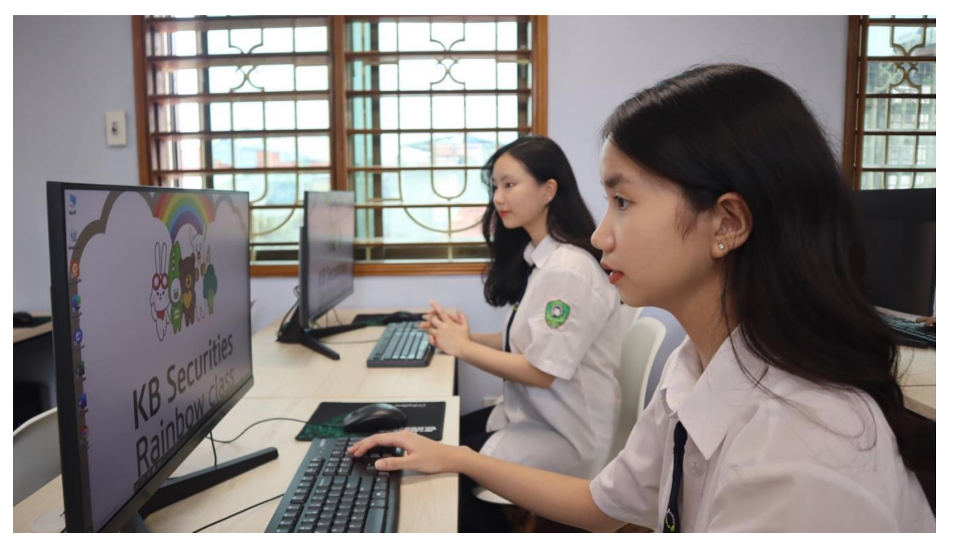
Các em học sinh trải nghiệm phòng máy tính mới.

KB Securities has cooperated with World Vision Korea and World Vision Vietnam for many consecutive years to implement the Rainbow Classroom Project to connect and assist local communities and areas with complex conditions. In countries where KB Securities is developing business.