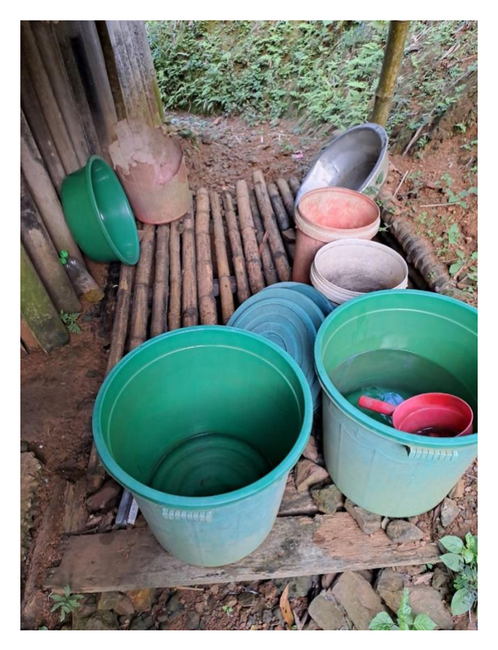
Local people lack safe water filtrations and storage

The donation of 1 million Taiwanese dollars (equivalent to approx. VND 780,000,000) from CMUH will go to the construction of water supply systems, toilets and handwashing facilities in five targeted communes of Thach Thanh district. Communication sessions will also be implemented to improve WASH practices among local people, especially children.