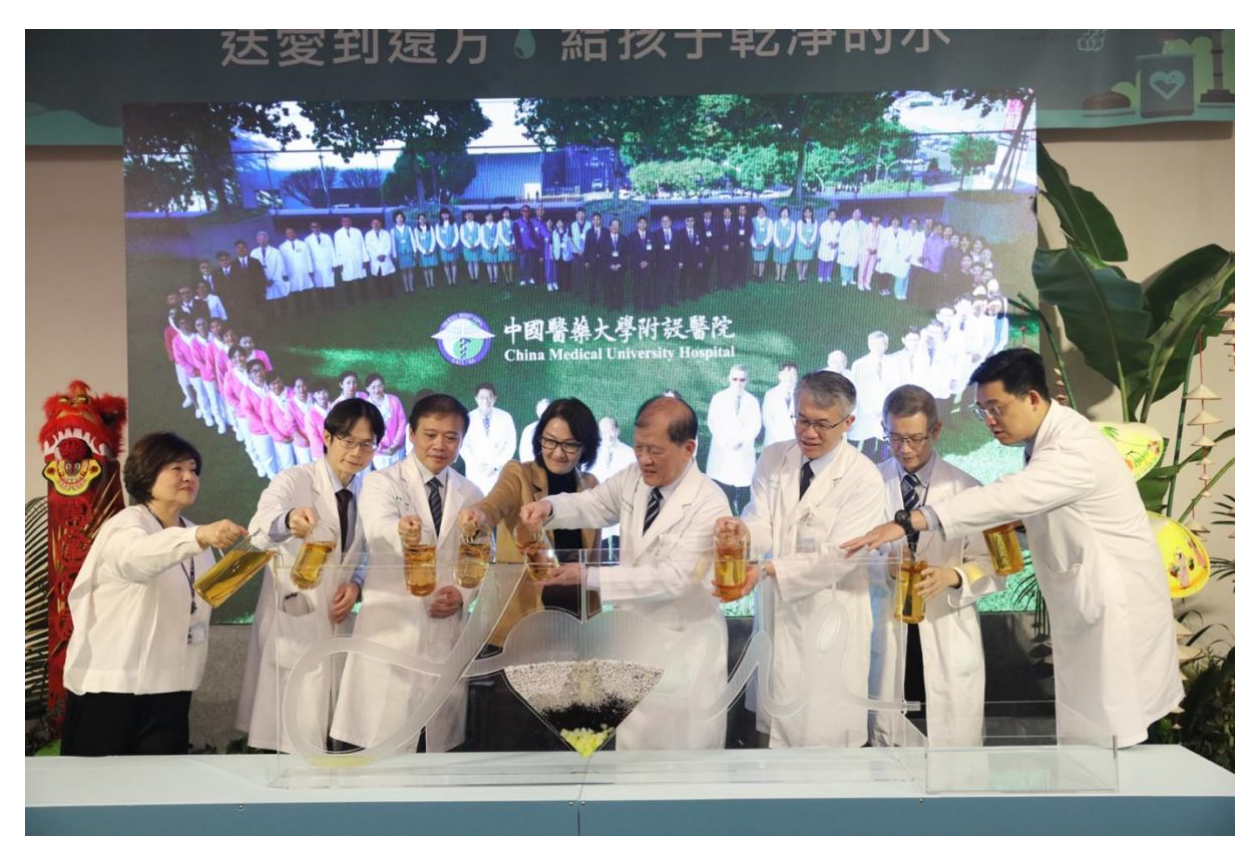
Representatives from CMUH and World Vision Taiwan participated in the activity of filtering the dirty water and made it become clean, which represents the meaning of this "Sending Love Away" campaign. Also, this action symbolized providing endless love and hope for children.

Children from Thanh My Kindergarten in Vietnam also performed a hand-washing dance. The cute smiles on their little faces and the innocent and shining eyes conveyed joy, as if they could finally wash their hands with clean water!