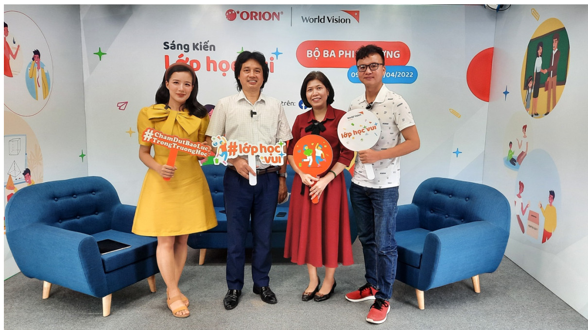
Figure 3: The talkshow's speakers in Hà Nội.

Facing the development of school violence in Vietnam, the "Hope in Class" Project has actively connected families and schools in its activities so that schools are no longer a playground for children alone. Still, they are also filled with parents' presence and supervision. The beneficiaries of the Project are not only children but also parents/caregivers and teachers. Specifically, when participating in the "Hope in Class" Project, parents/caregivers and teachers are equipped with knowledge and skills to accompany children more effectively. The active participation and close connection based on understanding and empathy between families and schools will contribute to nurturing young minds, providing them with a safe and loving living environment, helping them develop their full potential, and becoming active members of society in the future.