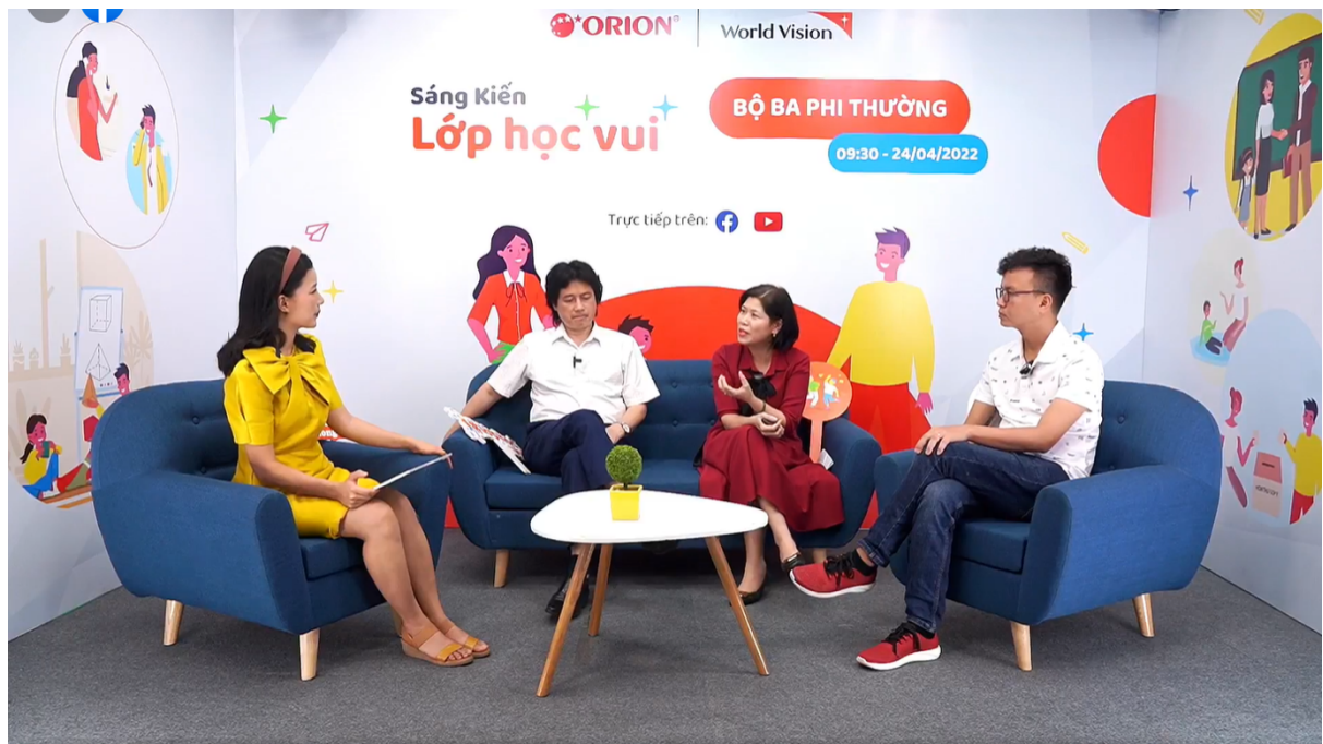
Figure 1: The overview of the talkshow.