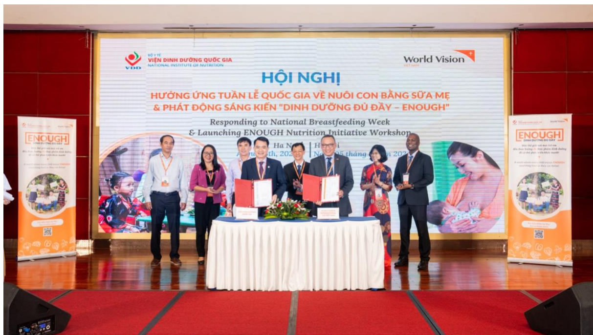
World Vision International in Viet Nam and the National Institute of Nutrition signed a cooperation plan for implementing ENOUGH in the upcoming 2 years.

A cooperative plan for the ENOUGH Nutrition Initiative in the Fiscal Year 2024 was signed during the occasion by World Vision International in Viet Nam and the National Institute of Nutrition. The strategy is a significant step in raising the nutritional status of Vietnamese children in 2024 and beyond. The primary endeavours of ENOUGH encompass: