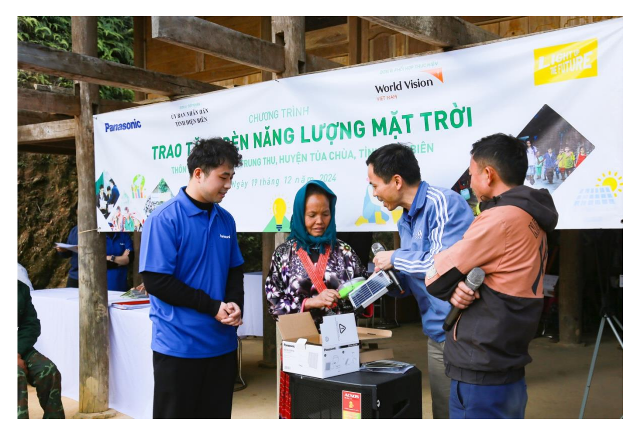
Panasonic, World Vision International in Viet Nam handed over solar lanterns to 510 vulnerable households and guided them on using the devices.

This programme aims to improve the quality of life for local communities, particularly helping the most vulnerable children to study better at home. This initiative is part of Panasonic's global project "Light up the Future" which aims to bring light to areas without electricity, thereby supporting local communities in accessing better education, healthcare, and income opportunities, ultimately contributing to poverty alleviation and sustainable development.