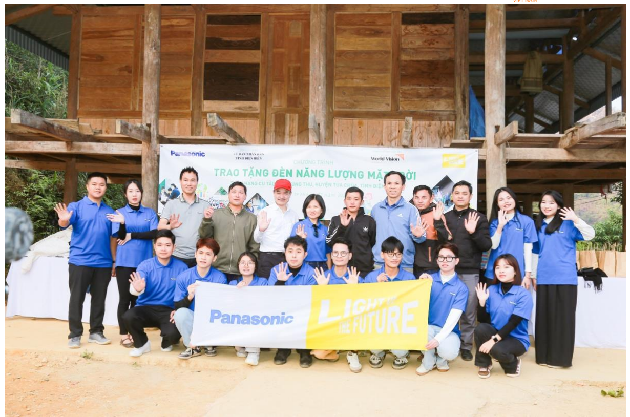
The group of young volunteers participated in supporting the Panasonic's 'Light Up the Future' event.