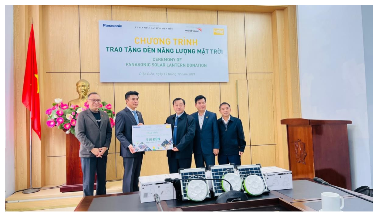
Representatives from World Vision International in Viet Nam, Panasonic, and the People's Committee of Điện Biên Province have joined hands to implement the programme.

Since its inception in 2013, Panasonic has successfully donated 100,000 solar lanterns using the company's renewable energy technology to disadvantaged areas in more than 30 countries. In Viet Nam, the project has donated over 2,800 solar lanterns, positively transforming the lives of people in non-electric areas of Dien Bien, Yen Bai, Thanh Hoa, Quang Nam provinces from 2015 to 2023.