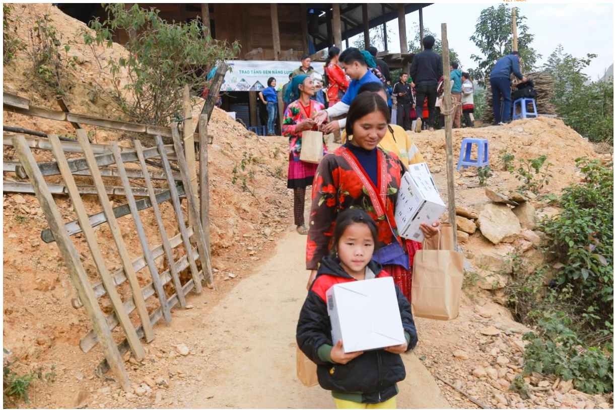
Children and community members came to receive solar lanterns provided by Panasonic.